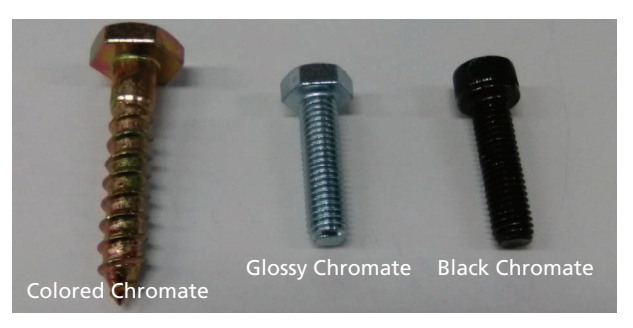
Fig. 3 Chromate-Coated Screws