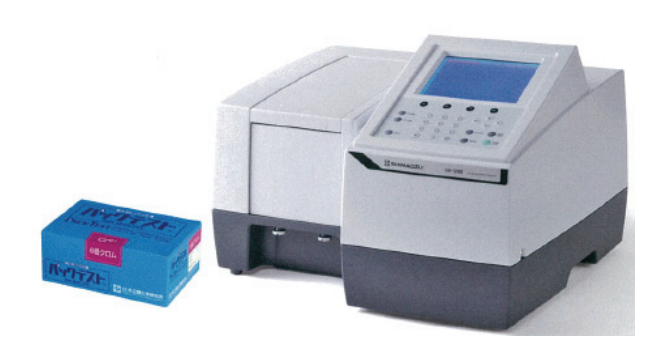
Fig. 1 UV-1280 and PACKTEST Product

Item Measured : Hexavalent chromium (PACKTEST)