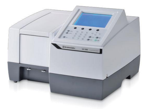
Figure 1: UV-1280 UV-VIS spectrophotometer

A CPO sample was provided by a palm oil manufacturer in Malaysia. Commercially available edible palm oils were purchased from local markets. Analytical grade chemical reagents and solvents used were purchased from Sigma Aldrich, USA and Merck Millipore, Germany. The CPO and palm oil samples were analysed according to the following tests - deterioration of bleachability index (DOBI), carotene content, anisidine value and phosphorous content. All measurements were conducted using the Shimadzu UV-1280 UV-VIS spectrophotometer (Figure 1).